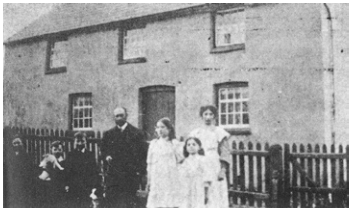
Family at Cefn Bryn Isaf Farm (early 1900s)

They managed to get a short reprieve: the eviction date of 30 April 1940 was pushed back to 30 June to allow farmers to lamb before they moved or sold their stock.