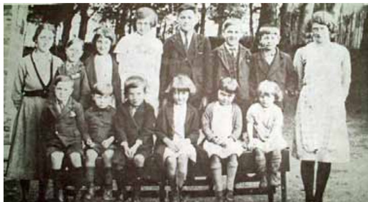
Cilieni School (1934)

The number of pupils at Cilieni primary school fell from 39 in 1882 to just 13 in 1939. But the community was close and by no means dead.