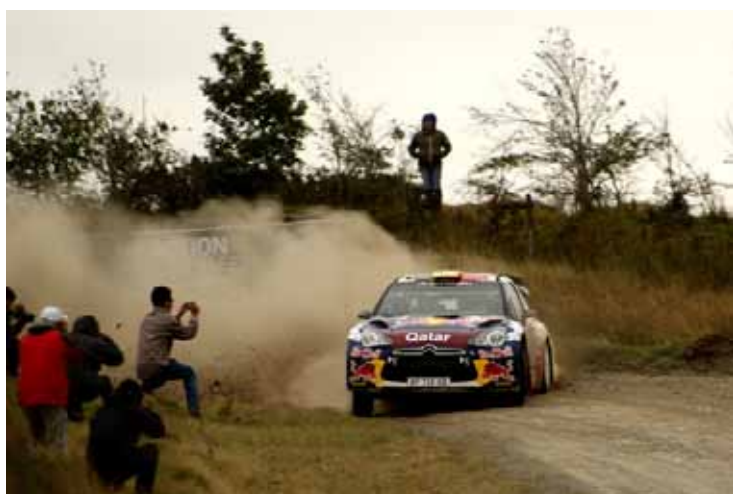
Wales Rally GB on the Epynt (2012)

An estimated 35,000 spectators congregated on the mountain to watch each weekend that it was held.