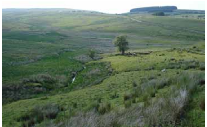
Mynydd Epynt is an extensive area of upland

The uplands of Wales are actually very diverse in character.