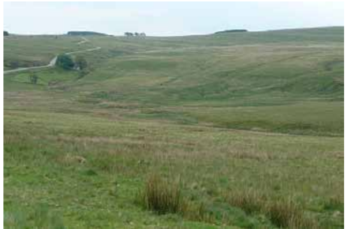
Open spaces away from towns and cities are ideal for military training

This area of Mynydd Epynt was established as a military training area in 1940. It was identified as being particularly suitable for several related reasons.