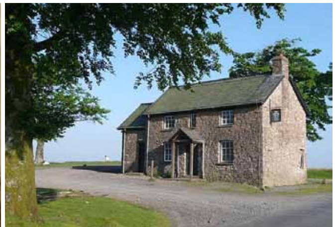
The Drovers Arms today, requisitioned in 1940 and used as a troop shelter