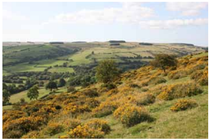
View from the Epynt Way

Mynydd Epynt is a stunning natural landscape which was shaped by tectonic forces and ice sheets. It is an upland area characterised by open moorland, unimproved grassland and blanket peat bogs. Here thrive birds of prey and colourful fungi. It is also a landscape inhabited for many centuries by farmers and their sheep.