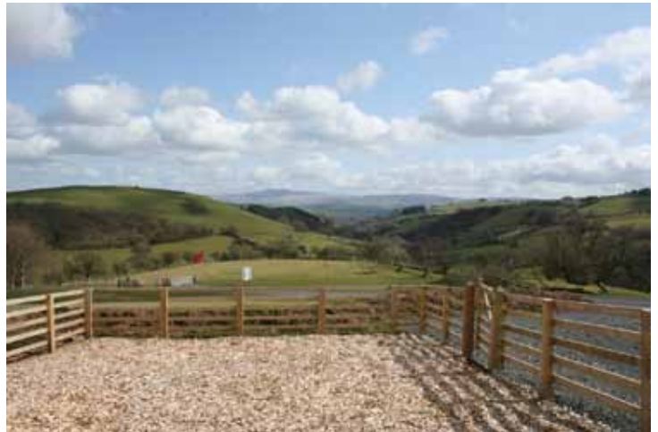
Horse corral provided for riders using the Epynt Way

A group of local people who use the Epynt Way regularly have named themselves the 'Epynteers'.