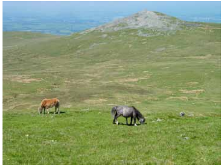
Wild ponies grazing in the northern Carneddau mountains

Welsh mountain ponies are descended from the prehistoric Celtic pony. They developed as a hardy breed in order to survive the tough climate and poor-quality grazing that these upland habitats provide.