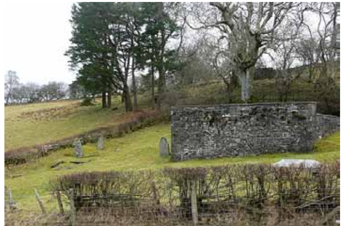
The ruins of Babell chapel which once served the community of Cwm Cilieni

On the side of this building you can see a sign that gives the original Welsh name of the farm that stood here, Ffrwd-wen.