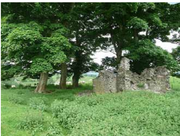
Ruins of a shepherd's cottage

This walk also told the story of the requisition of this land by the military at the beginning of the Second World War and its rebirth as Sennybridge Training Area. The local population was evicted, their farms and community buildings left in ruins and the traditional names of places wiped from the landscape. The natural landscape and the climate made it ideal for training troops and testing weaponry. For many decades, only soldiers and sheep inhabited these open, windswept slopes.