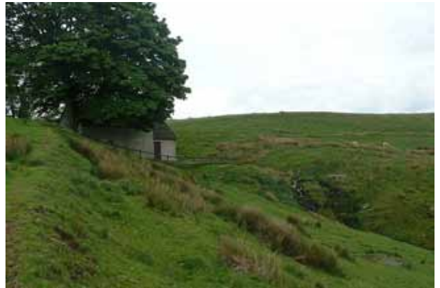
Troop shelter on the site of a Ffrwd-wen farm

By the 1930s this area, along with many other rural areas across Britain, was experiencing decline.