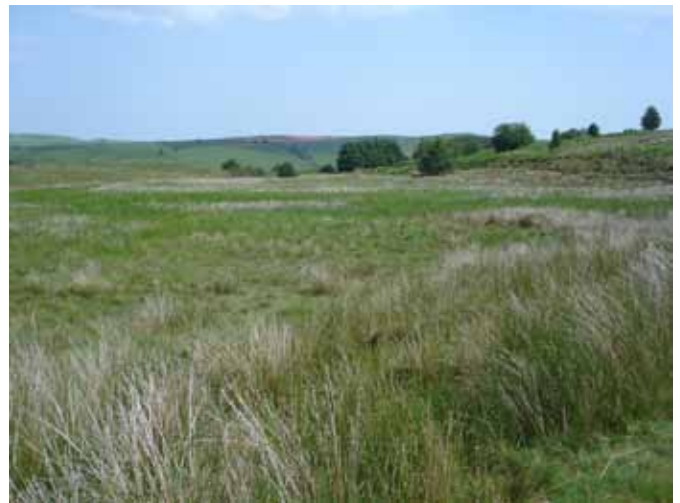
Blanket bog beside the track

In this environment several types of habitat are dominant including woodlands, grasslands, blanket bogs and heathlands. We will encounter each of these on this walk. Here is an excellent example of a blanket bog.