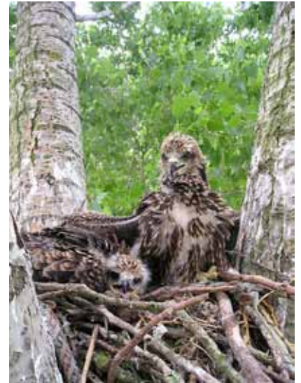
Two Red Kite nestlings

The mission succeeded in protecting the birds. Chicks hatched in all three nests and the RSPB wrote to thank the Brigade. This is one example of how the military and conservation can complement one another.