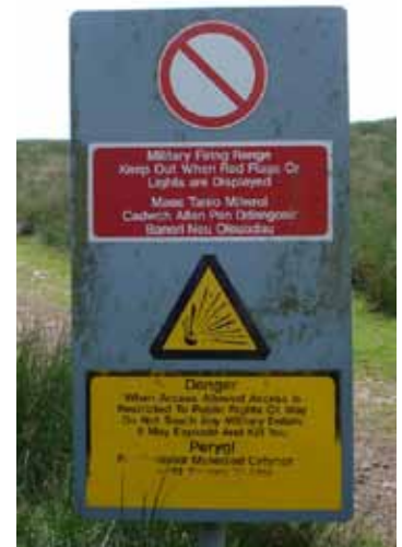
Military warning signs

This is where we will be walking so keep your eyes peeled and you may spot some in action – camouflaged, of course! Remember that the soldiers are in active training so you must respect the fact that they are working. Learning survival skills up on the mountain is no easy business!