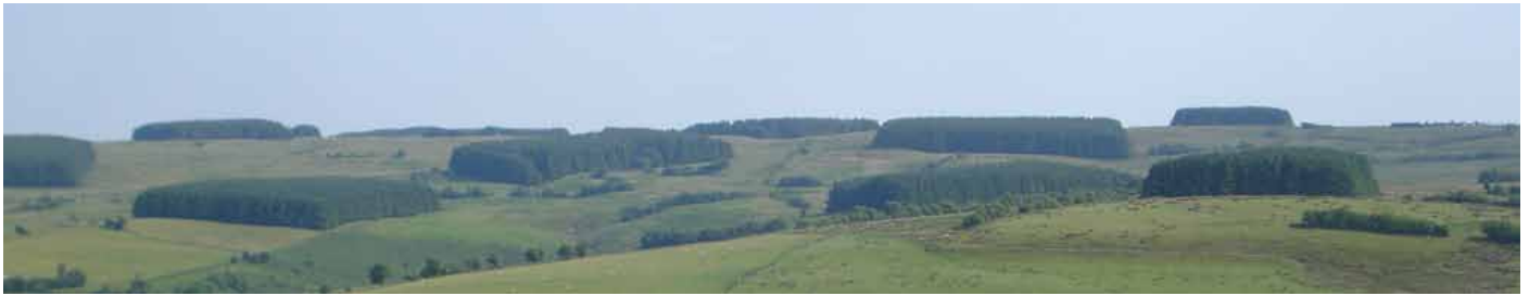
A series of plantations on the hillside

Although we've just arrived at the edge of a wood, this upland environment is largely a treeless place. The poor soil quality and high winds make it difficult for tree species to thrive on uplands so they tend to cluster in the more sheltered combs and valleys that are cut by streams and rivers.