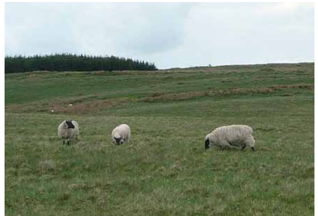
Sheep grazing on the Epynt