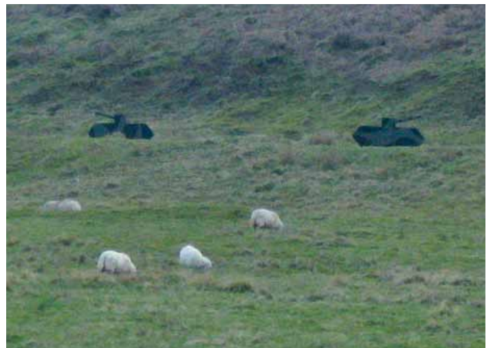
In the firing line! Sheep grazing in sight of a firing range (left) and in front of fake tanks (right)