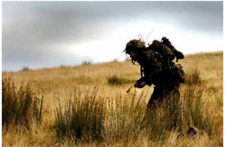
Soldier moving across peat moorland on SENTA

You'll be quite safe, though, as you follow part of the Epynt Way footpath around the perimeter of Sennybridge Training Area (SENTA).