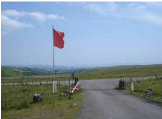
Red flags signify military training in progress

The other part of the training area is the 'live' firing area where tank manoeuvres, shelling practice and exercises using live ammunition take place. There is a high risk of unexploded ordnance in the ground so it is unsafe (and forbidden) for civilians to walk in that area. Although we can't enter the 'live' firing area there are vantage points along the way from where we can see right into its heart.