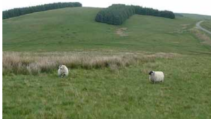
Sheep in front of an L-shaped plantation

Other than these small patches of trees, military areas have remained relatively free of blanket forestation in comparison to other uplands.