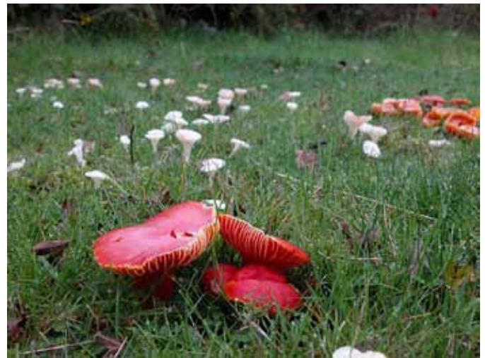
Hygrocybe coccinea and Hygrocybe virginea

They depend on nutrient-poor grassland but disappear immediately if fertiliser is added to the soil.