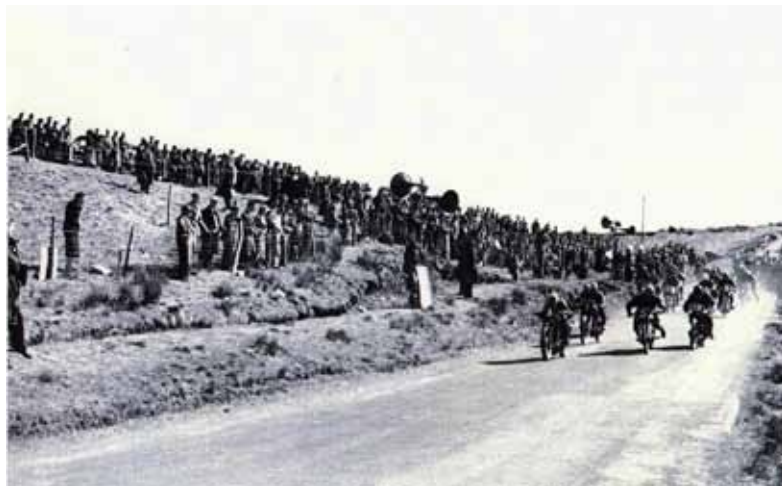
Start of the 350 cc TT Junior at Epynt (1953)

It was Britain's largest mainland mountain circuit and the race ran every year between 1948 and 1953.