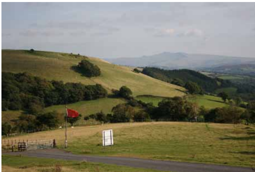
The boundary between the military area and surrounding farmland