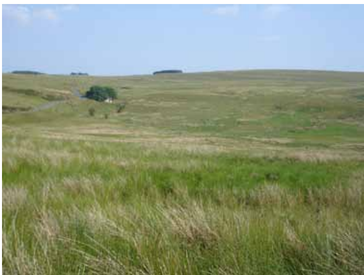
The open and largely treeless moorland

It's an opportunity to find out what makes this upland environment special and what kind of habitats thrive here. Along the way there is evidence of the communities that lived here for generations and made a living from sheep farming in this exposed and isolated place.