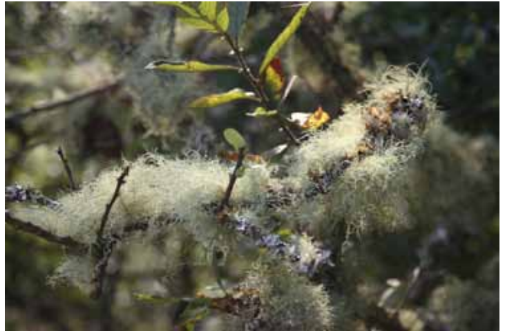
Moss on a tree

Sennybridge Training Area has been awarded SAC protection which goes to show what an exceptional landscape this is with such rich habitat and species thriving here.