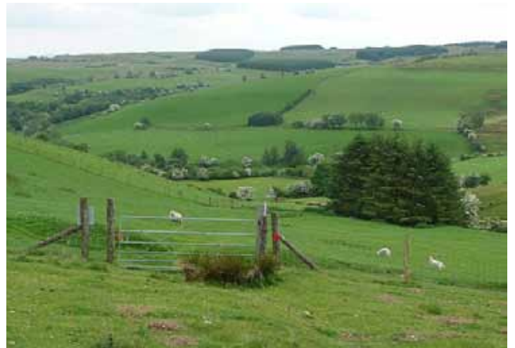
A landscape of fields and hedgerows on the other side of the fence