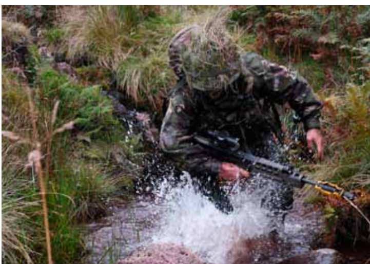
Soldier crossing a stream at SENTA

First the natural features of the landscape – a highland plateau – provided the open ground for testing machinery and weaponry.