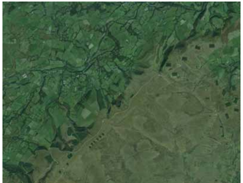
A satellite view clearly shows the difference between uncultivated moorland and cultivated farmland

The military land is a palette of yellows, browns and green with little to no hedging.