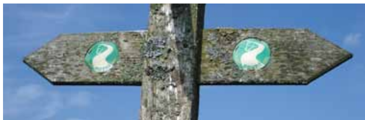
Epynt Way fingerpost

that allows public access to the countryside. The Act provided the British public with a right to roam on open, uncultivated and upland areas – a right that walking groups such as the Rambler's Association had been campaigning for since the mid-nineteenth century.