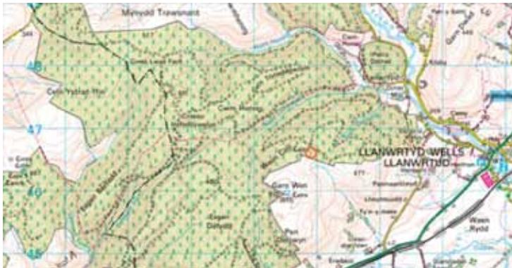
Area of blanket forestry to the west of SENTA © Ordnance Survey

These are managed as commercial forests and are planted with evergreen trees such as conifers. The trees are fast growing and have straight trunks providing a renewable source of good timber; in contrast our native deciduous trees are much slower growing so are less suitable for commercial exploitation.