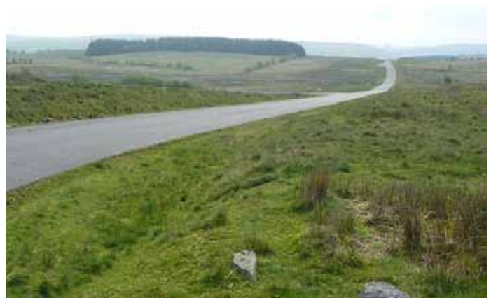
One of the military roads crossing the training area

In fact many of the farms in the area have such signs after a campaign by the Fellowship for Reconciliation in Wales, a pacifist organisation that protests against the ongoing training of military troops here. The MoD permitted these signs to be put up.