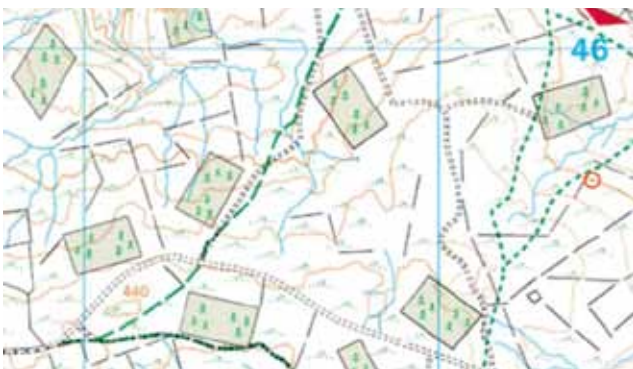
Rectangular plantations scattered across the moorland © Ordnance Survey

Although we've just arrived at the edge of a wood, this upland environment is largely a treeless place. The poor soil quality and high winds make it difficult for tree species to thrive on uplands so they tend to cluster in the more sheltered combs and valleys that are cut by streams and rivers.