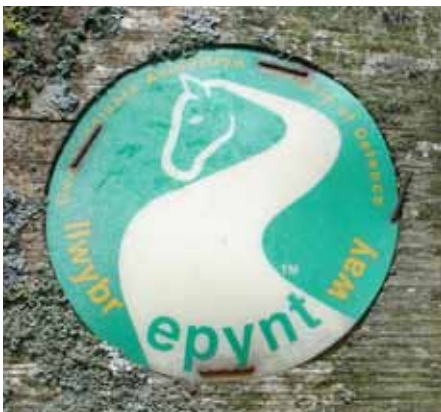
Epynt Way logo

Many wild ponies in Britain are really 'semi-wild' which means that they are owned but allowed to roam freely on open land. However, there are a few truly wild ponies that have never been owned or handled. They exist in the most remote Scottish islands and in the highest Welsh mountains.