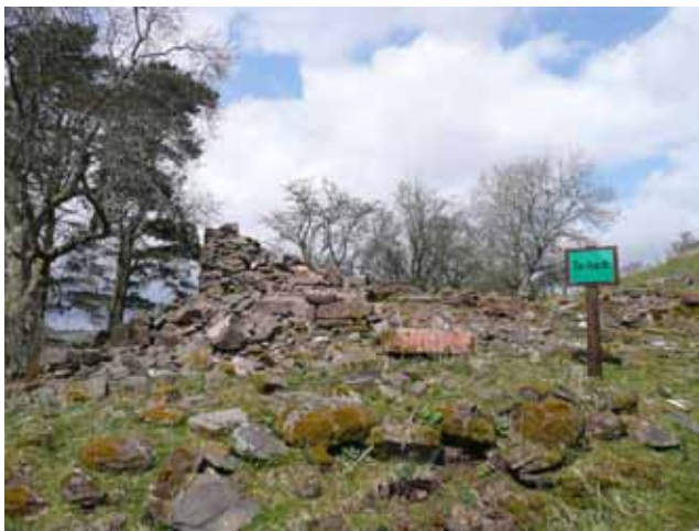
Ruins of an old farmhouse with a sign showing its name

Welsh place names had been replaced by English ones when the military took over. Roads, junctions and viewing points were all given names including Burma Road, Gun Park Road, Piccadilly Circus, Canada Corner and the rather uninspired Concrete Road!