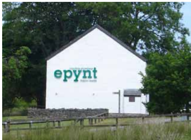
Epynt Visitor Centre

I have walked around a number of military training areas and can assure you that this walk takes you to one of the most impressive of them all. We are in Sennybridge Training Area (or SENTA) which covers 12,000 hectares of Welsh upland.