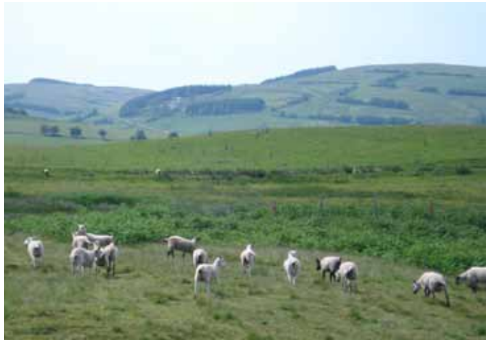
Sheep grazing the unimproved grassland inside the boundary fence

Much unimproved grassland has been lost due to the intensification of agriculture and building on former farmland so remaining areas like these are very significant as they provide rare habitats for some equally rare species of plants and animal, as we shall see in due course.