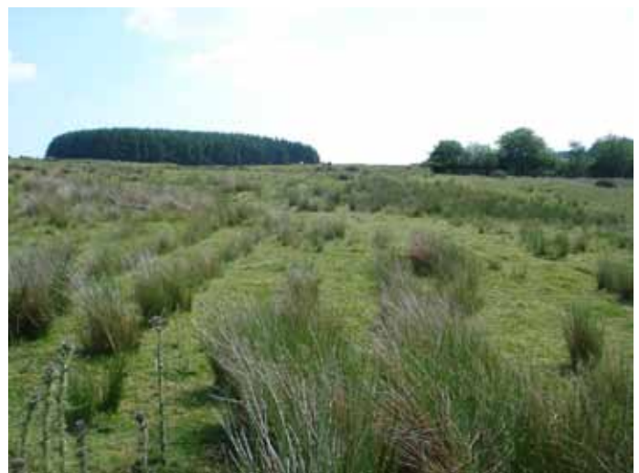
Unimproved grassland